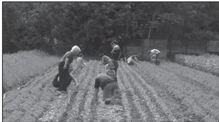
Les Jardins de Cogne (technical visit).