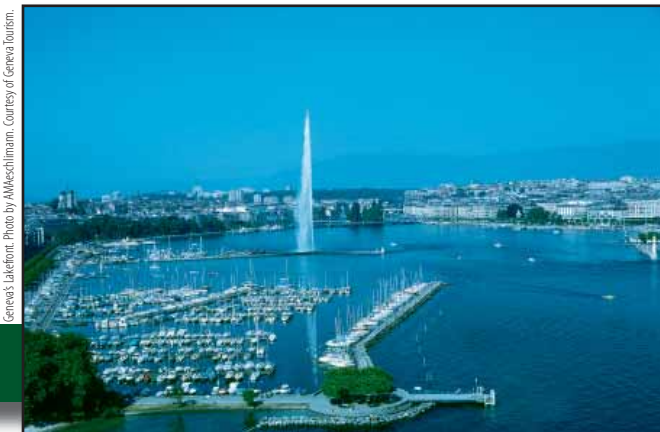
Geneva's Lakefront.

Paper submission deadlines updated! See page 36.